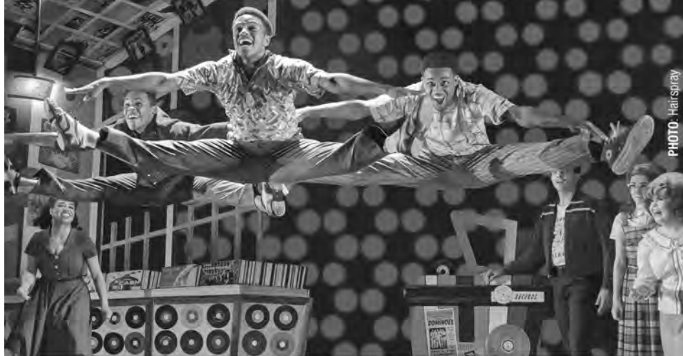
PHOTO: Hair Spray