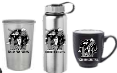
Steel Cups, Water Bottles, & Mugs